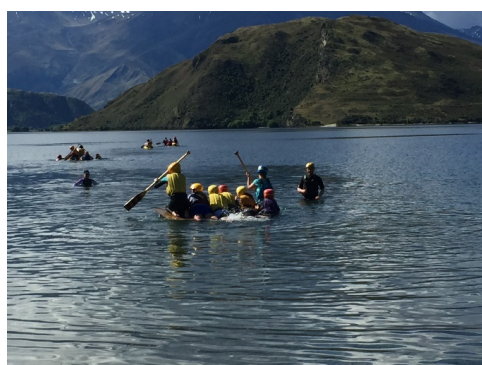
Rafting at Lake Wanaka

Recently I had the pleasure of spending some time with our Y10 students, while they were on camp at Glendhu Bay. For many years this camp has been held at Borland Lodge, but for the last two years we have transferred it to the shores of Lake Wanaka, mainly to catch some better weather. (our booking at Borland Lodge was in the middle of winter!) Some students went on an overnight camp to the Mt Aspiring hut. Other activities included a visit to Diamond Lake, a walk up Mt Iron, Mountain Biking, Paddle Boarding, Rafting, Kayaking, Rock Climbing and Abseiling.