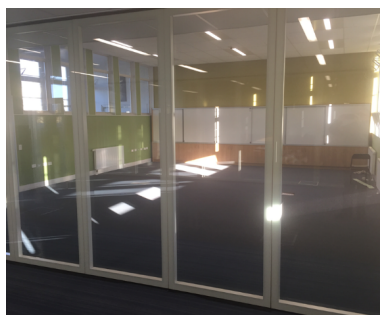
Flexible folding walls.

This year saw the major remodel of six classrooms in the block nearest Coutts Road. (We call this A-Block.) This comprised three downstairs classrooms, as well as the three immediately above these. All of the classroom walls were solid concrete and the work entailed cutting out four major walls, and replacing these with a significant amount of new steelwork. The final result is four enlarged classrooms (not six), with breakout spaces in between. Flexibility is provided by large wall dividers. Staff are enjoying using the rooms, which have a light and spacious feel to them.