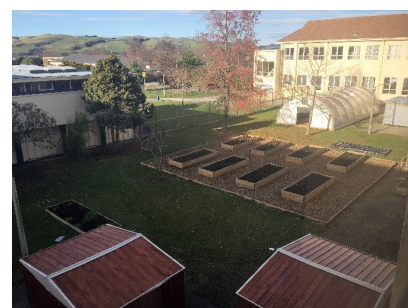
New Horticulture area, with library top left of photo.