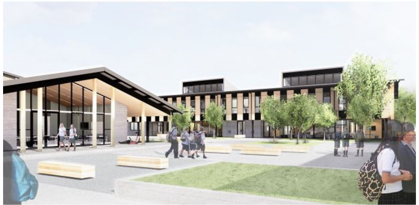
Design Image Example – Linwood College

Procurement will then take place for main contractor and the Ministry currently estimates that construction will get underway in 2023.