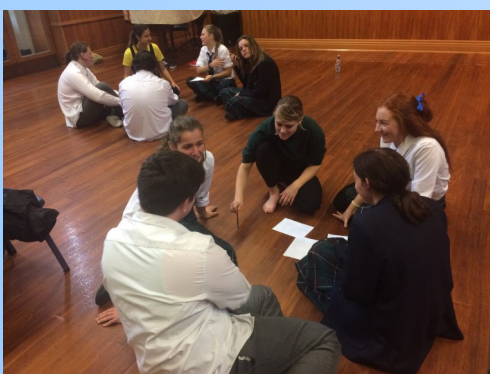
Senior drama students attend a workshop after the performance.