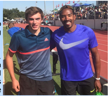
Christian Taylor, World and Olympic Champion

The trip was a great experience for both the athletics and the tourist side of things. I would highly recommend it to anyone wanting to compete overseas.