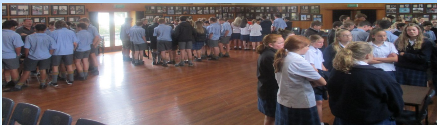
The students gathered around each speaker and then moved to the next speaker at the sound of the air horn