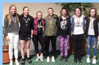
Left: Junior medal winners pictured at the GHS Club prizegiving last night