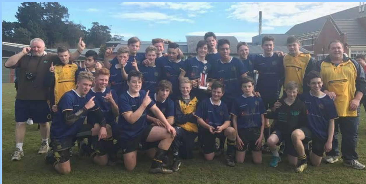
The U14 team shortly after their victory last weekend.

This weekend our U15 team play their final against SBHS Red on Gore High No. 2 at 1.15pm. They go into the final with a record of being unbeaten all season. It would be great to have supporters along to cheer them on. Good luck to the team!